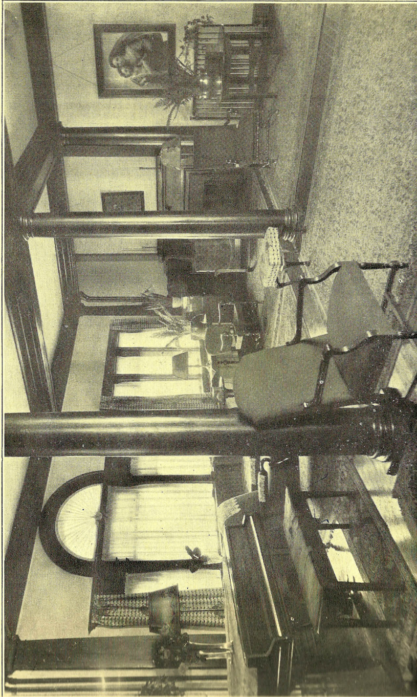
RECEPTION ROOM IN NURSES' RESIDENCE