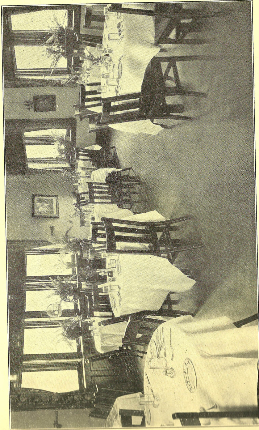
NURSES' DINING ROOM