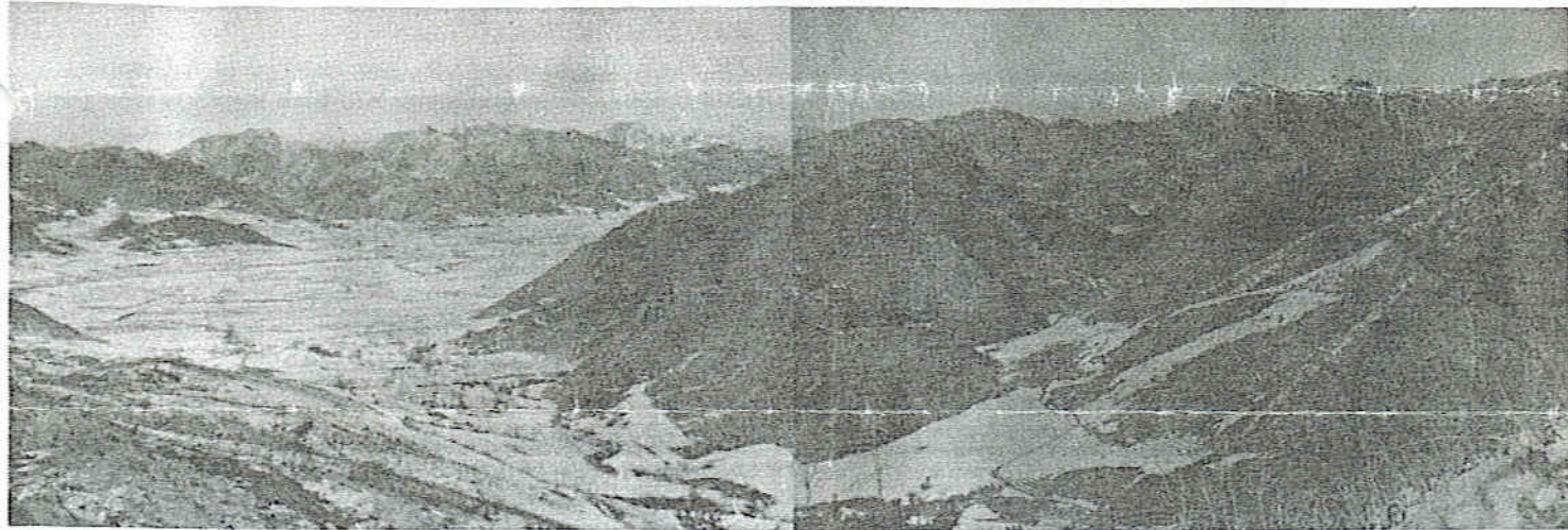
Chungbangp'yong, early February 1952